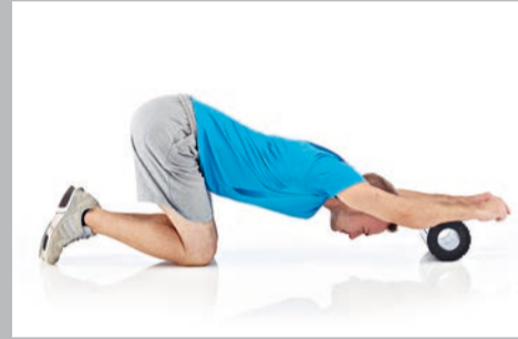
SHOULDER AND CHEST