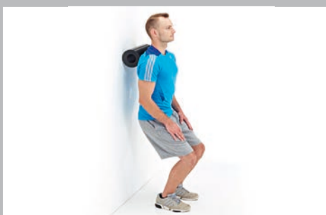
BACK AND NECK (STANDING)