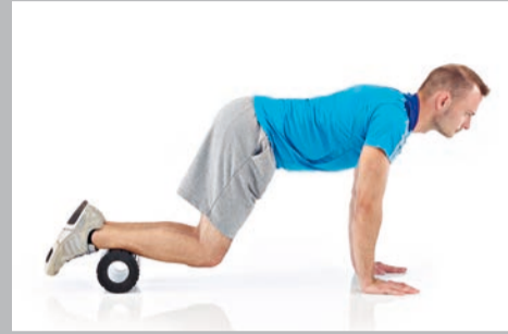
TRUNK AND SHIN