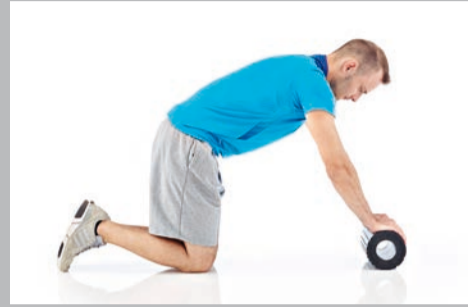
SHOULDER AND CHEST