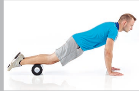
TRUNK AND SHIN